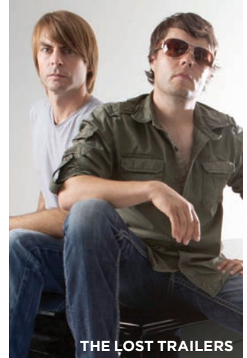
THE LOST TRAILERS

The Lost Trailers are flying high with "Underdog" as the title ranks No.12 overall, up from No. 18 last week and No. 24 two weeks ago. "Underdog" also stands as the No. 16 favorite. Core 35-44 listeners push it to No. 14 from No. 23 two weeks back. They also grade it their No. 15 favorite. Younger 18-34s are at No. 13 with listeners 25-44 at No. 14.