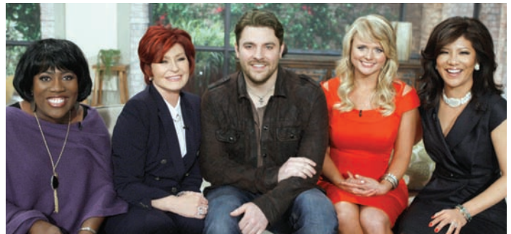
Miranda Lambert sat in as a guest co-host of the CBS daytime program "The Talk," where fellow artist Chris Young performed his recent single, "You." From left are regular co-hosts Sheryl Underwood and Sharon Osbourne, Young, Lambert and co-host Julie Chen.